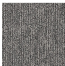
Influence 97535 LRV 17.6