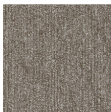
Impact 97100 LRV 21.7